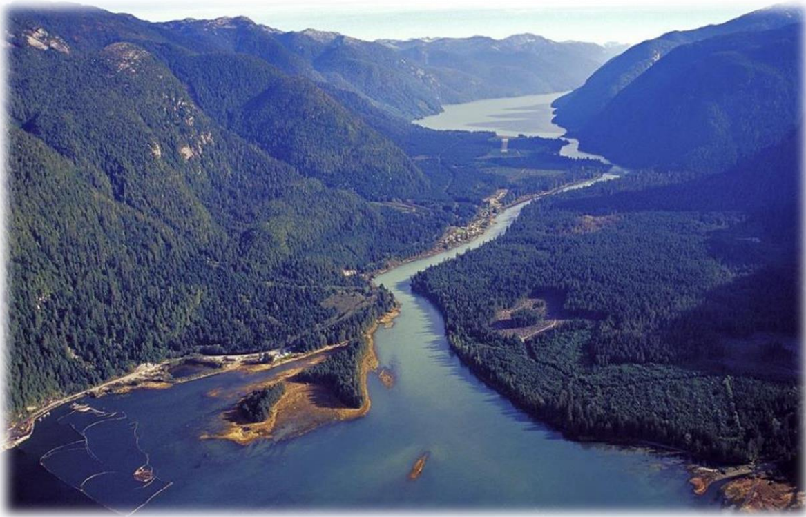
Rivers Inlet looking up the Waanukv River toward Owikeno Lake (Oweekeno Community on left)

The Waanukv River is a wide, powerful stream draining a large coastal watershed. For the size of the river it has very limited spawning grounds for salmon. Because it comes out of a large lake, there is limited replenishment of spawning gravels washed downstream in winter floods.