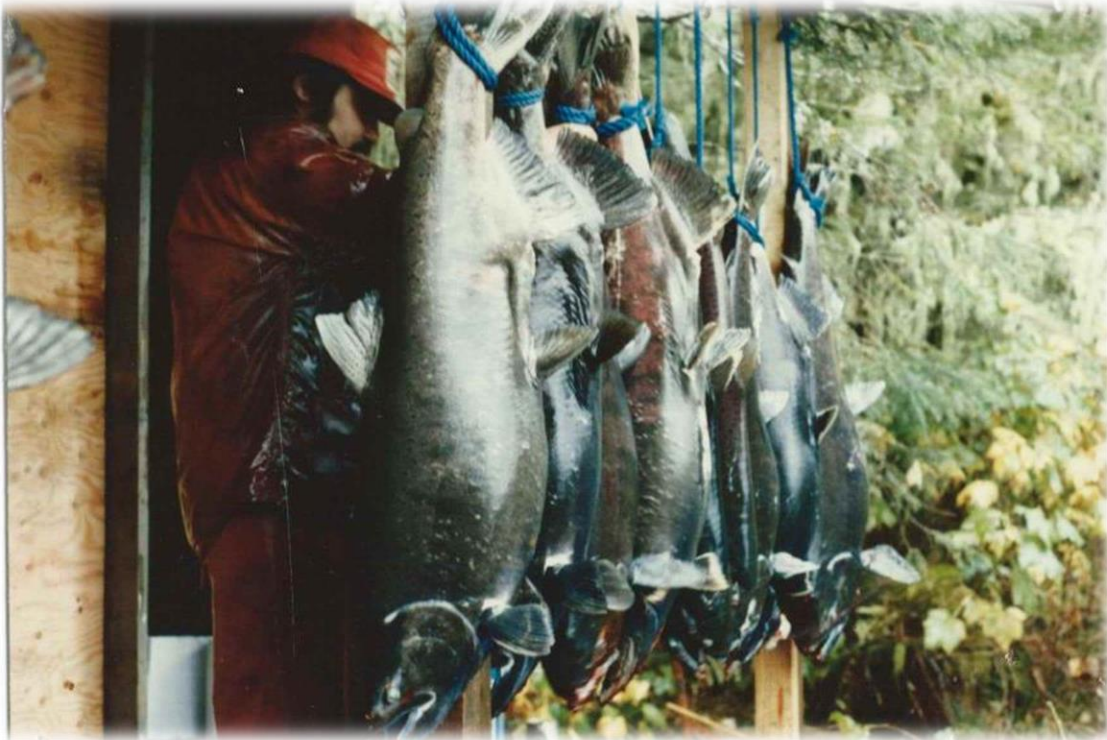
Waanukv River Chinook salmon ready for egg-take

them were ready and were expressing milt. If they were ready they were killed quickly for use in the egg take.